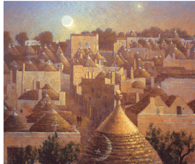
Waxing Moon, Alberobello Pastel 1016 x 1220 mm