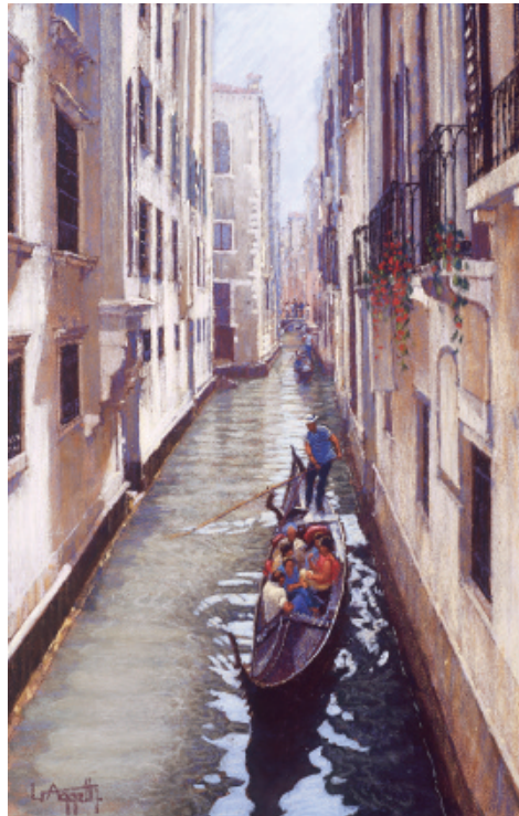
Venetian Jade Pastel 500 x 325 mm