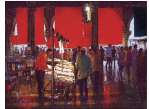
La Pescheria Pastel 250 x 325 mm