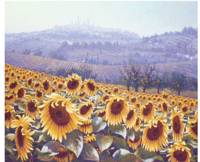
Tuscan Gold, San Gimignano Pastel 1016 x 1220 mm